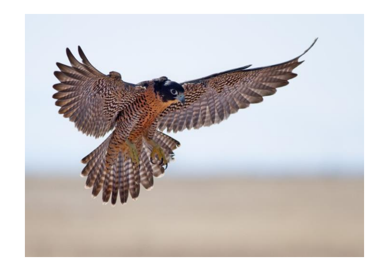
Why is a New Approach Needed?